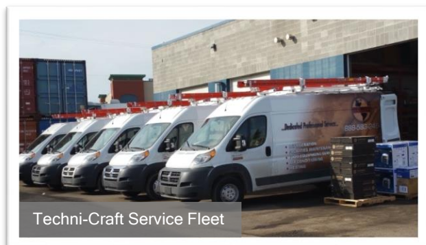
Techni-Craft Service Fleet